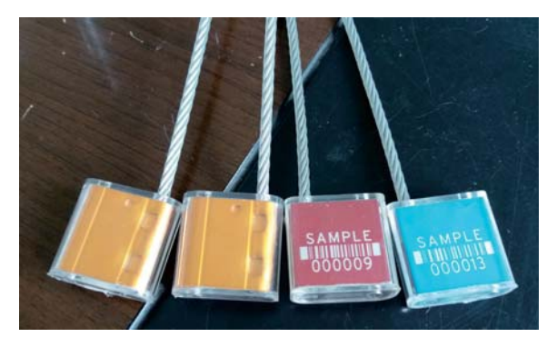
The lock body is protected by transparent plastic.if so, the number can not be tampered for wire 3.5mm